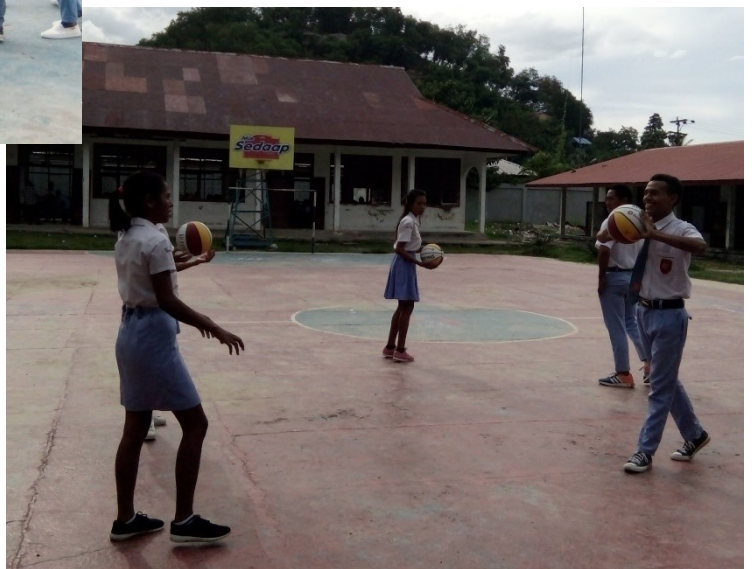
Above & Right: Boys & Girls.