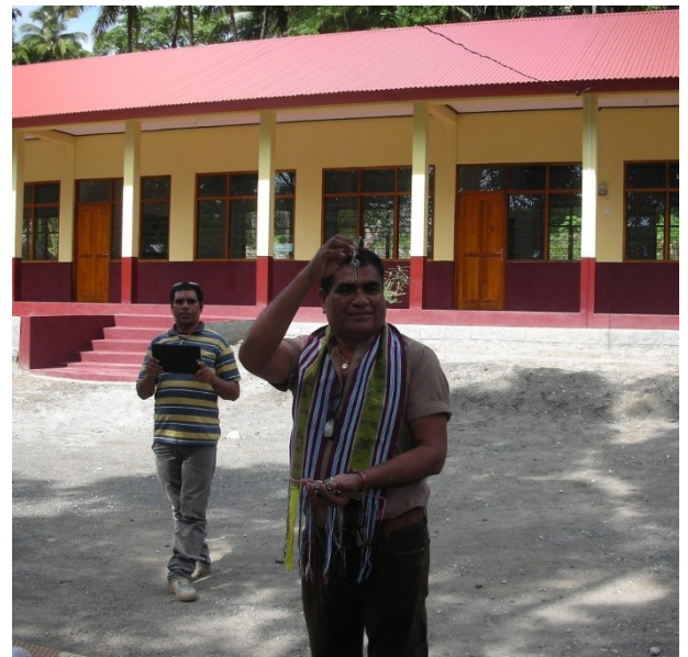
Photos of opening ceremony of Buruma School, including final handover of keys. (Look at that roof!)