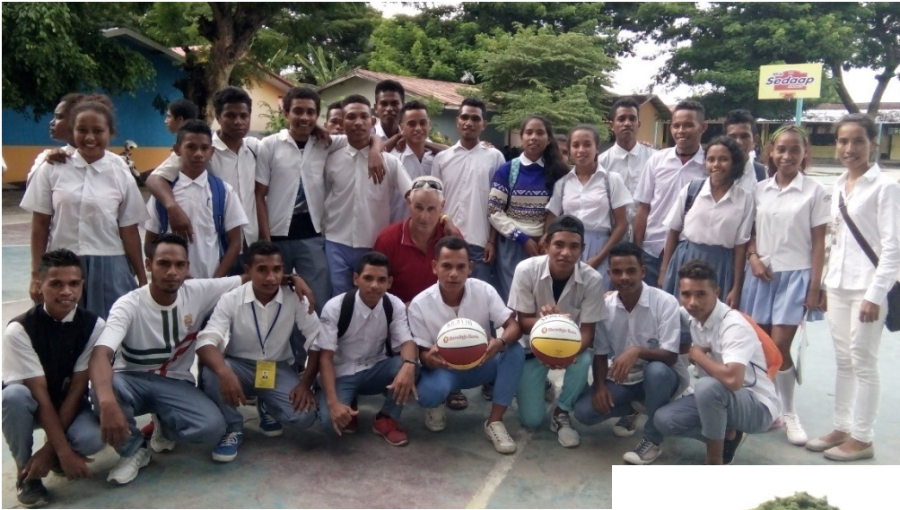
Above & Right: Two more presentations.