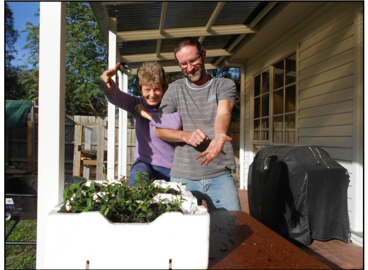
Enthusiastic club members showing off their green figures

Whitehorse Rotaract. They plant seeds in December/January and then travel to Beaufort in July to plant the seedlings. Beaufort Rotary coordinate with Landcare and find a suitable farm location to plant 2500 seedlings.