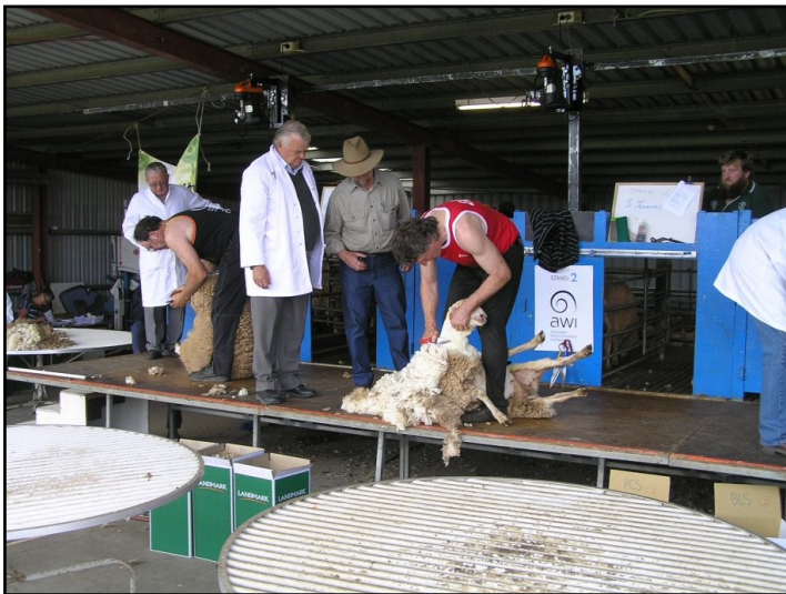
Shearing competition at the Beaufort Show

The Rotary Club of Mont Albert and Surrey Hills pledges a donation each year of $1000 to assist students fund their course and attends the presentation annual dinner.