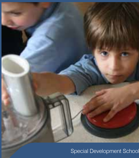
Special Development School