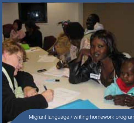
Migrant language / writing homework program