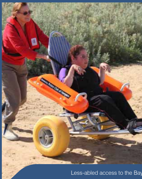
Less-abled access to the Bay