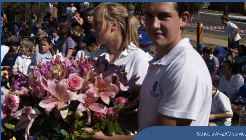
Schools ANZAC service