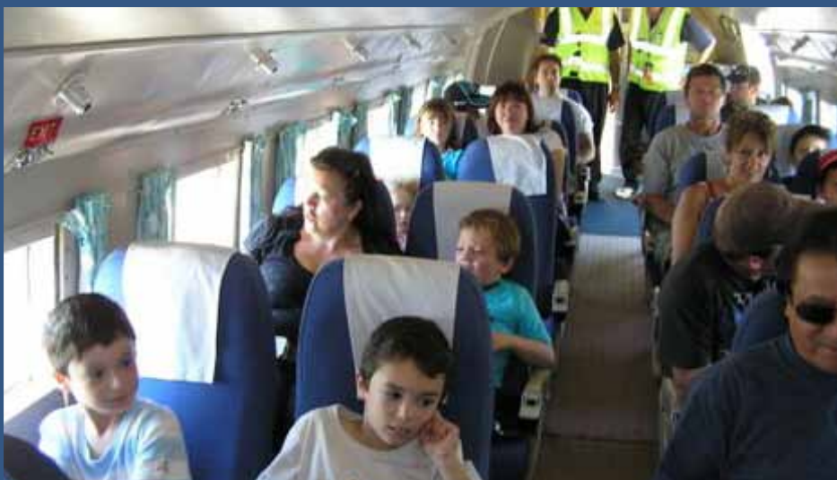
Southern Flying School – day out for autistic children & families