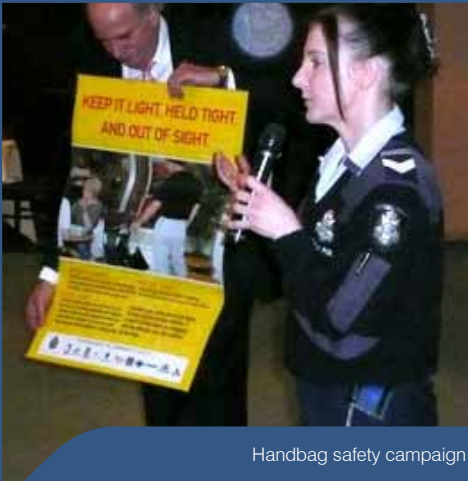
Handbag safety campaign