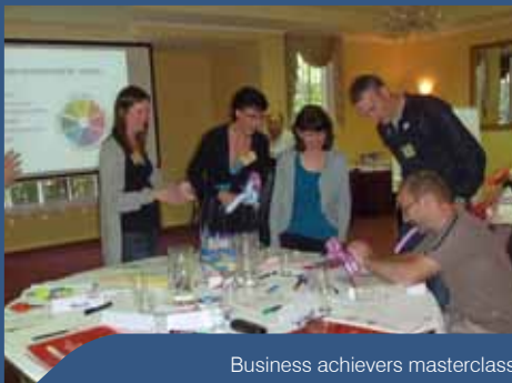
Business achievers masterclass