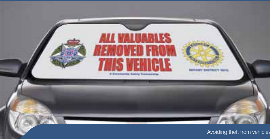
Avoiding theft from vehicles