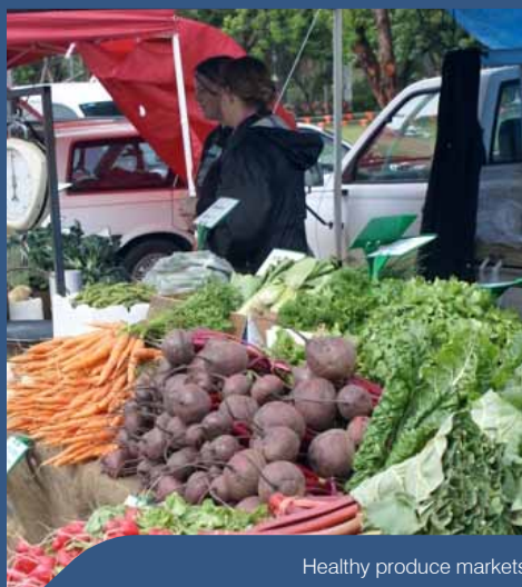
Healthy produce markets