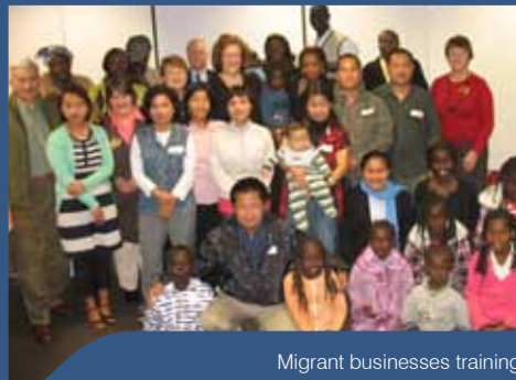
Migrant businesses training