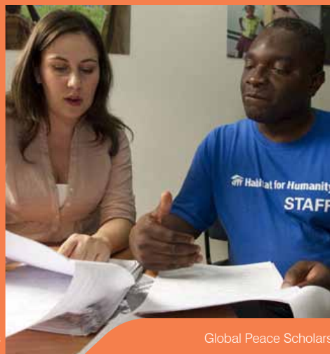
Global Peace Scholars