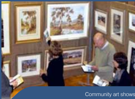
Community art shows