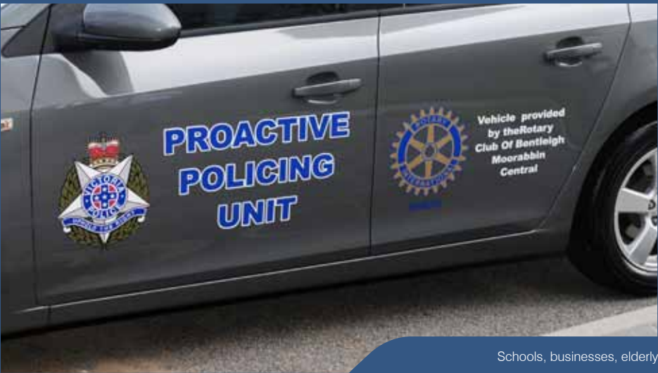
Schools, businesses, elderly