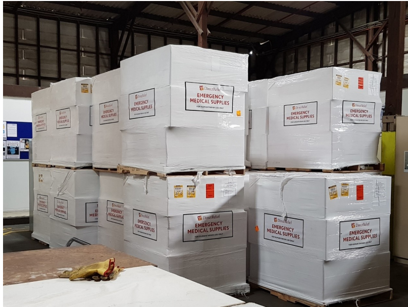
Shipment received - ready for next step - distribution.

Des Shiel D9810 DIK Contact (RC Lilydale)